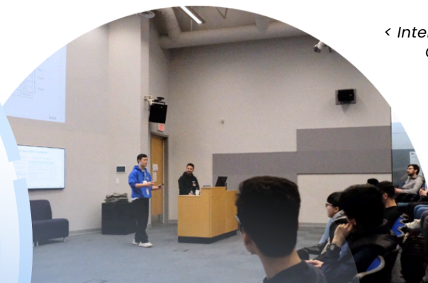
< Intel's recruitment session of Opfair 2024.

All of our sponsors will have the chance to meet with key members of the Faculty of Applied Science to discuss topics such as the skills they'd like to see developed in students, expectations for candidates and more. Additionally, our Silver- and Gold-tier sponsors are invited to host their very own 50-minute recruitment presentations and Q&A sessions.*