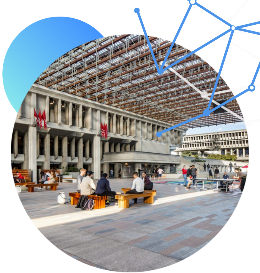
^ Simon Fraser University's Convocation Mall.

This year, we're setting up OpFair to be bigger and better than ever. Our venue of Convocation Mall is the bustling centre of our campus - it's spacious, high-traffic, and covered from rain. Electrical outlets, extension cords, complimentary breakfast and lunch, and more* will be provided.